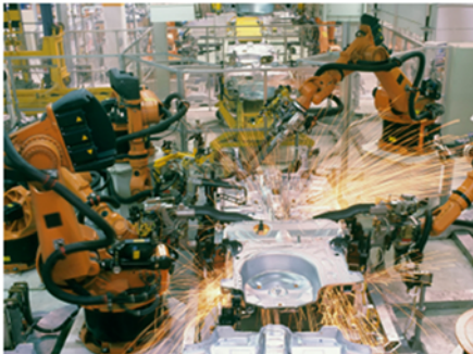
Harsh Environment Connectors and Markets

Bishop and Associates, Inc. announces the release of a new four chapter, 306-page research report providing a qualitative and quantitative analysis of nine selected markets that use connectors designed for use in harsh environments. The report contains data about harsh environment connector sales for the years 2013 through 2015F by end use equipment market segments, by product type and by region of the world. A five-year forecast is provided for 2020.